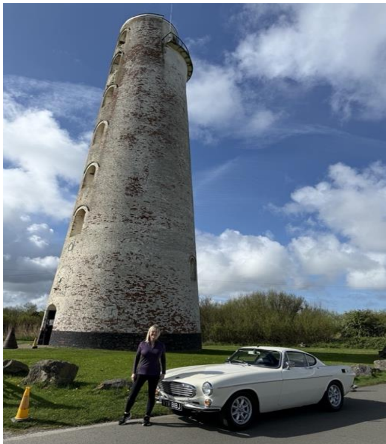
Treasure Hunt Leasowe Castle